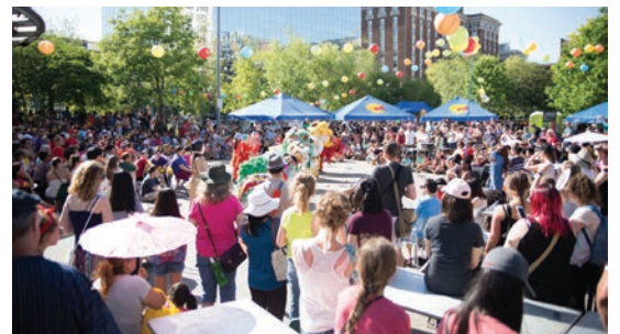
Old National sponsored the 2017 Asian-Pacific Festival in Grand Rapids, Michigan, and is the 2018 title sponsor.

Old National sponsored the first Asian-Pacific Festival held in Grand Rapids, Michigan. The goal of the 2017 event was to raise awareness of the issues facing Asian-Pacific communities.