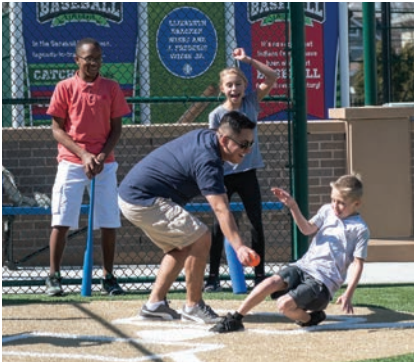
Baseball is one of several sports that families can explore as part of the Indianapolis Children's Museum's new indoor-outdoor Sports Legends Experience. Old National is a proud sponsor of the Sports Legends Experience Avenue of Champions.