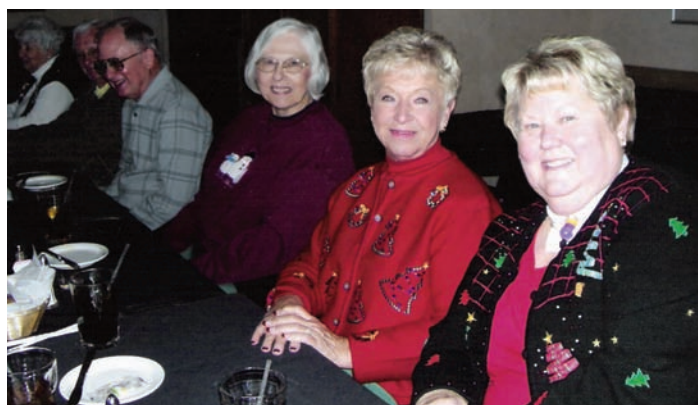
Pictured are a few of the retirees that were in attendance.