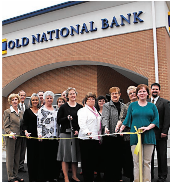
Grand Opening event in Paoli.

Old National celebrated the grand openings with a donation to local community organizations in Paoli and South Bend including, a $1,000 donation to the First Chance Center in Paoli, which provides services and assistance to Orange County residents with developmental disabilities.