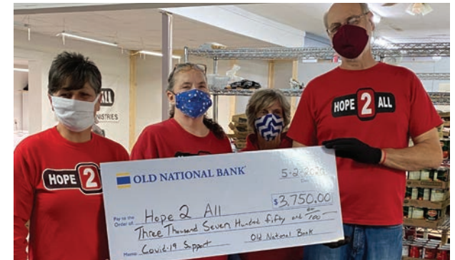
Providing relief and support to our local communities.

Old National participated in #GivingTuesdayNow to help address community needs related to COVID-19. Our contribution included a $3,750 donation to Hope to All Food Bank in Greenville, Kentucky.