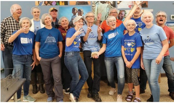
ONB team members in our Minneapolis-St. Paul, Minnesota market spent a fun day volunteering for Feed My Starving Children.