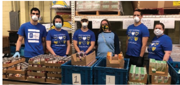
In May 2020, members of Old National’s Nexus Resource Group made 1,000 sack lunches and labeled hundreds of cans to assist a food bank in Evansville, Indiana.